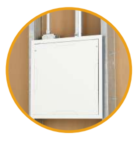
PAINTABLE FLANGES & COVERS