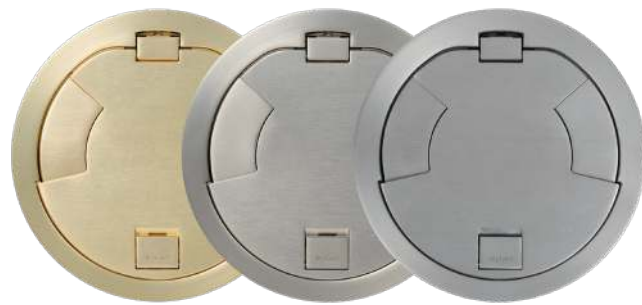
Satin Brass Satin Nickel Brushed Aluminum