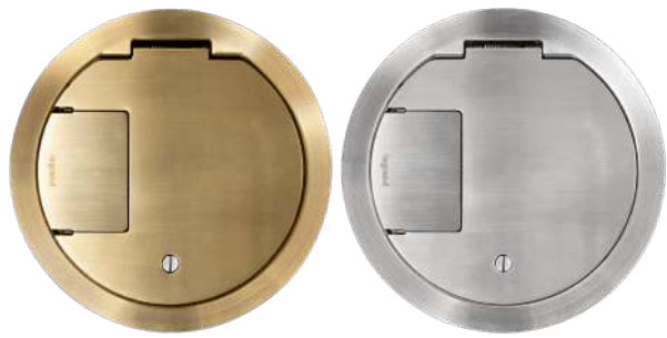
Brass Stainless Steel