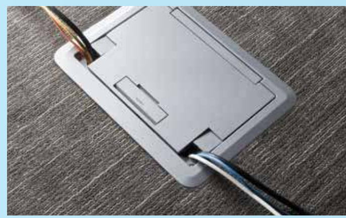
Sliding Doors Reduce Trip Hazards – Auto-close egress doors lock into position when slid open and automatically wrap around cables when the cover is closed, reducing trip hazards.