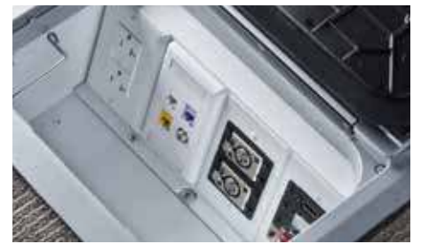
Accepts Standard Size Device Plates – Including single, double and triple standard size wall plates.