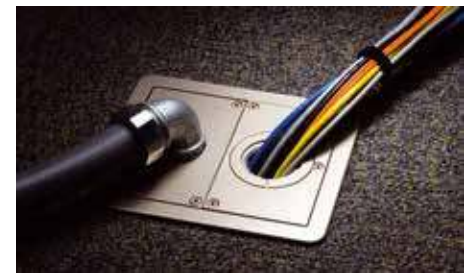
High Capacity Furniture Feed – Boxes are designed for concrete, wood and raised floor applications.