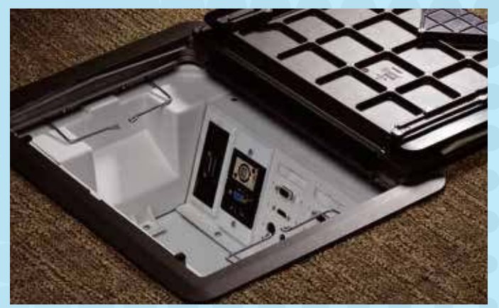
Easy Interior Access – Cover opens 180°, providing easy access when working inside the box.