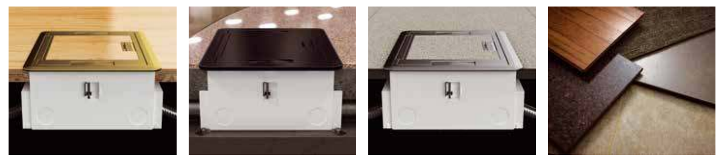
Wood Floor Concrete Floor Raised Floor Carpet, tile, wood, terrazzo and polished concrete surfaces