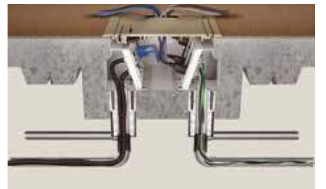
Two Hour Fire Rating – Fire classified for up to two hours and pre-assembled for fast, efficient installation. Just install conduit caps (included), position and secure the box to the desired height in the floor opening.