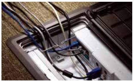
Keeps Cables Organized – Built-in cable management guides keeps cables orderly in the egress location, freeing up one hand when activating devices.