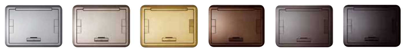
Aluminum Nickel Brass Bronze Gray Black

Covers are available in the above six finishes. There is also the option for a carpet insert or solid cover for surface and flush mount applications.