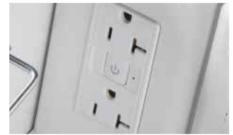
Plug Load Control up to 30 Feet – Tested with Pass & Seymour® Wireless RF receptacles to control plug loads up to a distance of 30 feet when the cover is closed.