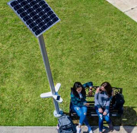
Solar Charging Kit