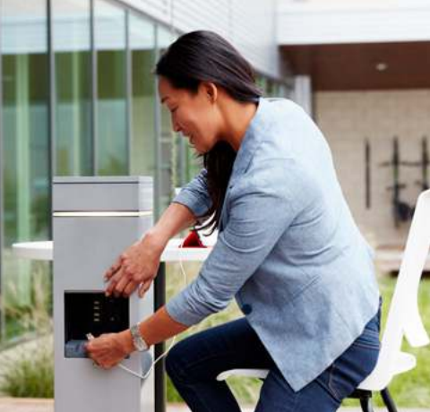
Outdoor Charging Station