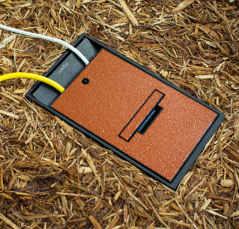
Outdoor Ground Box