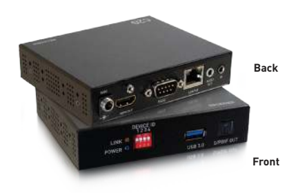
29976 HDMI over IP Decoder - 4K 60Hz