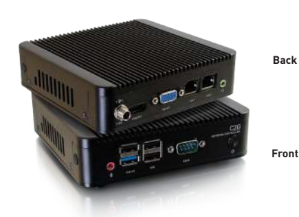
29977 Network Controller for HDMI over IP