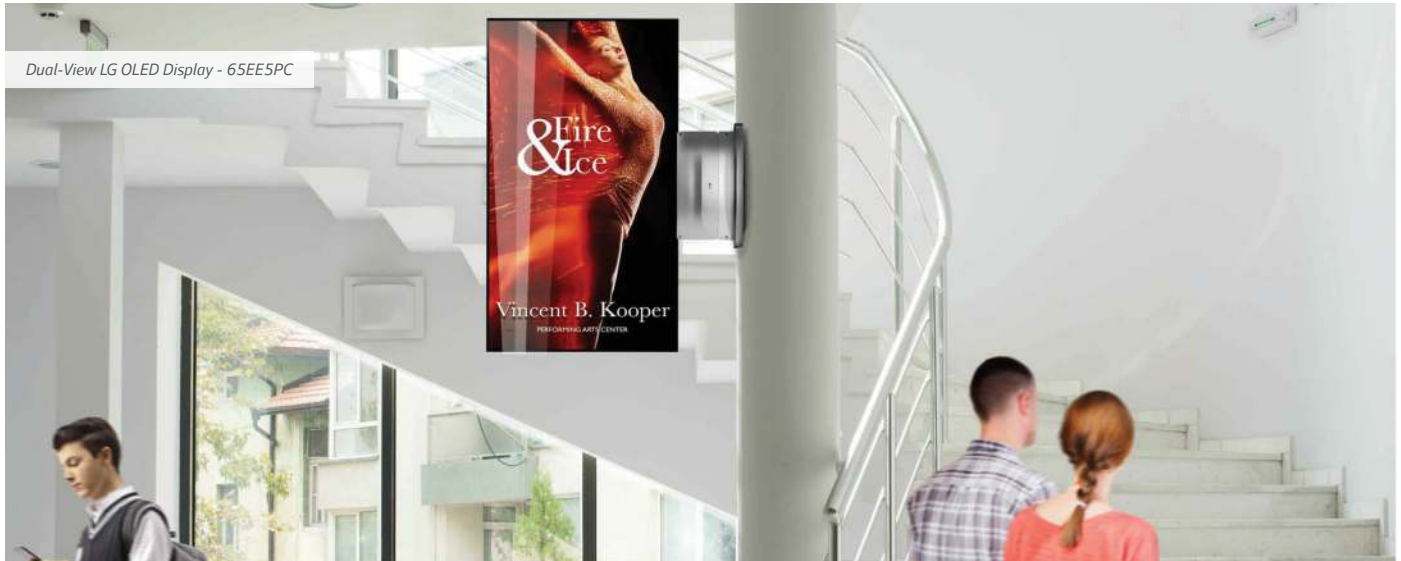
Dual-View LG OLED Display - 65EE5PC