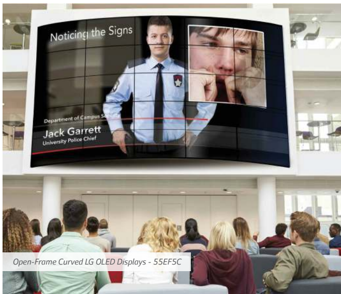
Open-Frame Curved LG OLED Displays - 55EF5C

Emergency Alerts – A campus-wide digital signage network allows an administrator to quickly push important information out to a single display, a group of displays or every display on the network.