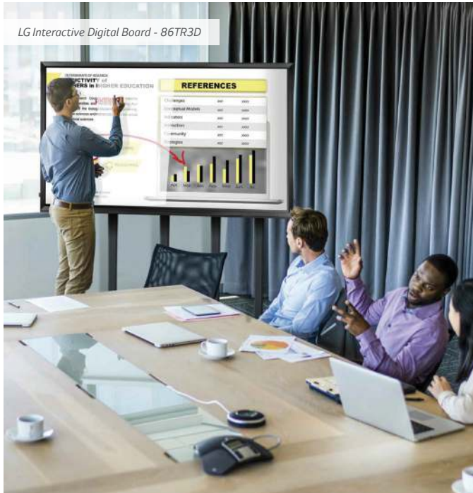
LG Interactive Digital Board - 86TR3D

teacher's instruction easier and more efficient, even in group instruction involving multiple locations. Every student receives the same content at the same time.