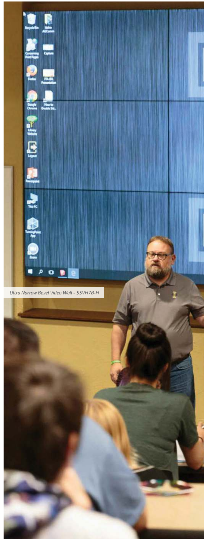
Ultra Narrow Bezel Video Wall - 55VH7B-H

Real-time Content – Availability of real-time content and video sharing via digital signage makes the