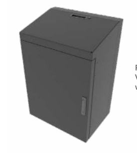
Pre-configured rack, VWM-SD-8-36K-BW, with a split, solid top.