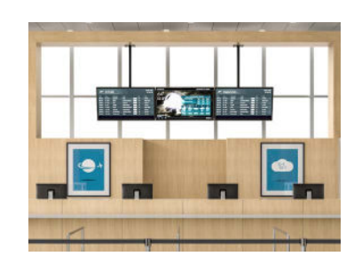
The LCM1U swivels to preferred viewing angles offering flexibility during install.