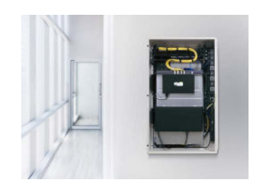
A look inside VWM-PD-4-36K-PW outfited with C2G cabling, Middle Atlantic Power, and a Luxul switch.