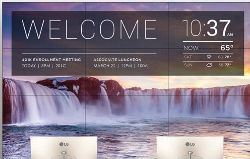
Ultra-Narrow Bezel Video Wall-49VM5C