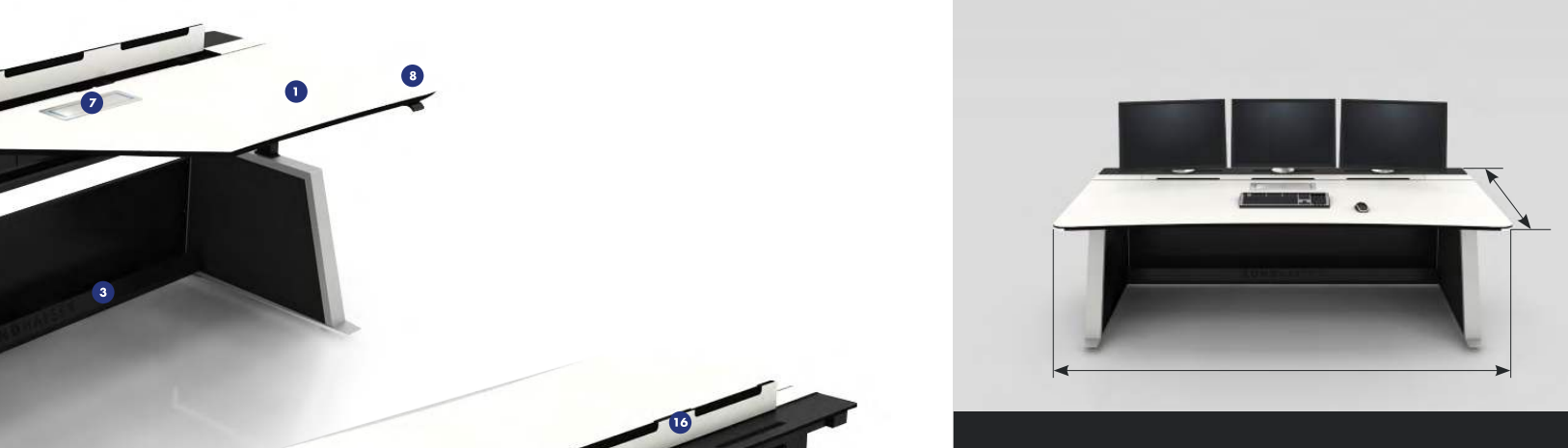
Width options: 54.5" to 89"