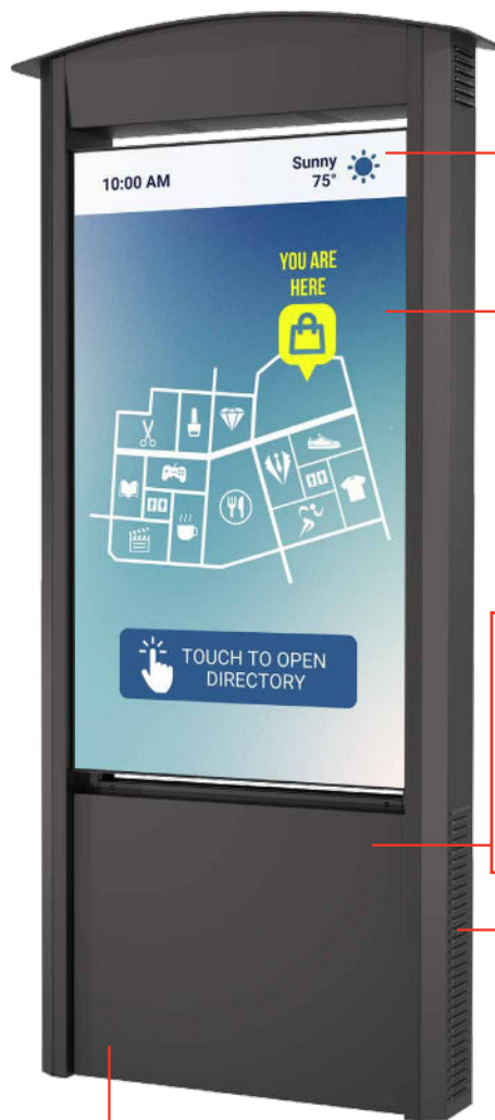
Model Shown: KOP55XHB

Upgrade your current signage with a brand new Peerless-AV® Smart City Kiosk. This next generation Smart City Kiosk will allow you to replace dynamic, digital content quickly, easily, and remotely, drawing in more engagement than your previous static signage. By combining a sleek, modern aesthetic with an approachable and easy-to-use design, the Smart City Kiosk puts functionality at the forefront. A 10-point IR touch overlay can also be added for an interactive customer experience. Outdoor elements are no match for this kiosk because it is all-weather rated, highly durable, and built to last. Maintenance and installation are also simplified with no cranes or forklifts needed and secure rear doors that allow quick access to the display for maintenance purposes. The Smart City Kiosk comes packed with ample component storage and a 55" Xtreme™ High Bright Outdoor Display with full HD1080p resolution. Even when placed in direct sunlight, you are guaranteed a bright and crisp picture when sharing digital signage content - Whether that is focused on travel, wayfinding, advertising, weather, entertainment, and more.