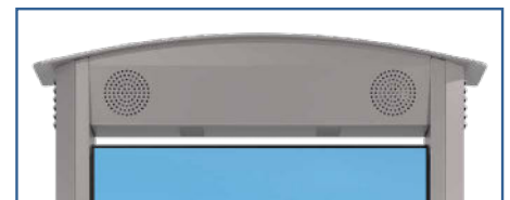
KOP55XHB(-S)A Includes (2) Speakers

Allow for display and component ventilation while keeping cords and other internals hidden from view for a clean install