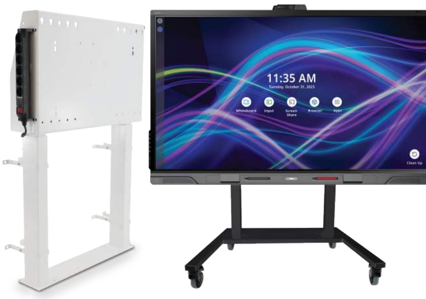
*Model availability may vary by region.

Add-on laptop shelf, handles and cord hook options are available.