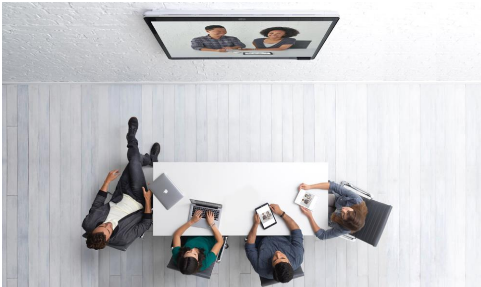
Figure 2. Video Conferencing on the Cisco Webex Board

The Webex Board is the latest addition to the portfolio of Cisco video and audio conferencing devices that register to Cisco Webex, including the Cisco MX and SX Series, the Cisco Webex DX80 , the Cisco IP Phone 7800 and 8800 Series, and the Cisco Webex Room Series .