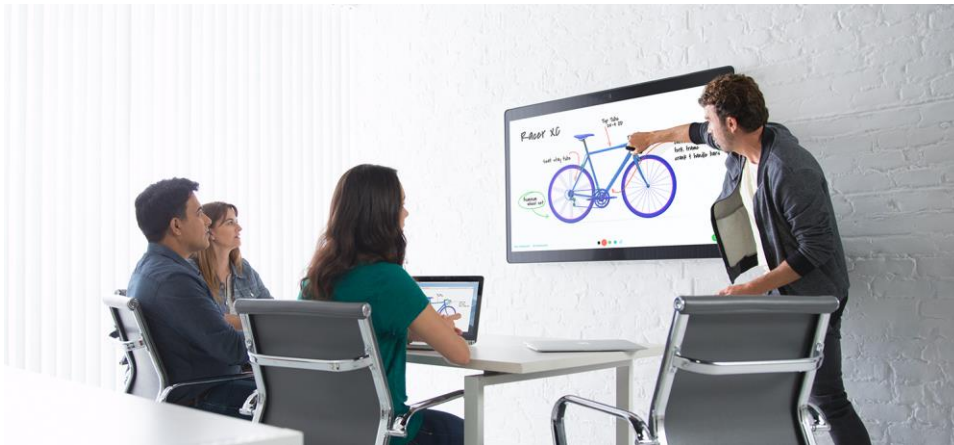
Figure 1. White Boarding Capability on the Cisco Webex Board 55

The Cisco Webex™ Board is an all-in-one device that provides everything you need to collaborate with your teams in physical meeting rooms. You can wirelessly present, white board, and have video and audio calls. And it securely connects to your virtual teams through the Cisco Webex service, via your Cisco Webex Teams app-enabled devices, so you can take your meetings and content on the road.