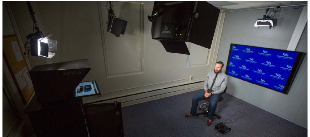
An IT-friendly video production studio is easy for employees to use and minimizes the number of issues users present to the IT team.

Corporate webcasting is increasingly being managed by IT pros who end up trying to cobble together live video with video conference cameras and encoders, Skype for Business, Zoom, or whatever other tools they're used to. Each of those pieces may work for their intended uses, but when trying to put them together for enterprise broadcasting, you're likely creating quality and interoperability issues as well as problems around scalability and ease of use.