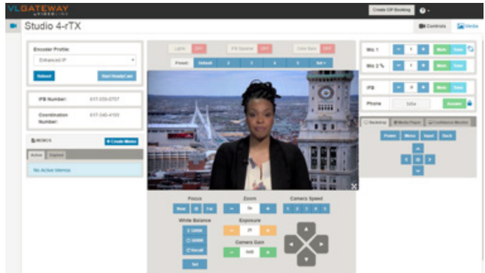
ReadyCam productions can be controlled remotely from a web browser.