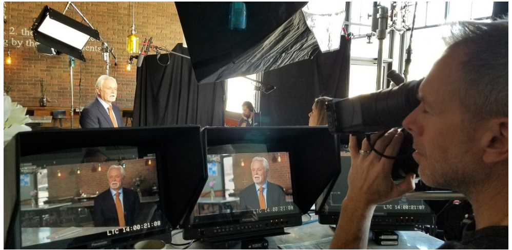
ReadyCam by VideoLink is an on-site video broadcasting and recording studio that can be easily controlled via a web browser.

Employee engagement increases significantly when employees feel heard, yet one study reveals that 85 percent of employees say that their managers only talk “at” them without actually listening. That’s why many company executives are turning to internal town halls to interact with employees.