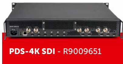
PDS-4K SDI - R9009651

DP + Audio card - R9802040 adding Dante® audio (de)embedding, passthrough and two DisplayPort 1.2 inputs.