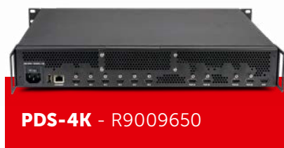
PDS-4K - R9009650