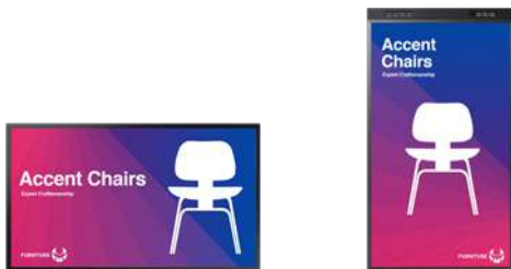
OMN series single-sided display operates in both portrait and landscape. OMN-D series dual-sided display operates in portrait mode only.

The Samsung OMN/OMN-D series was designed to do one thing: engage customers. Exceptionally bright and colorful, sidewalk traffic can't walk by without noticing your messages. The OMN single display features 4000 nits brightness, for impact on the brightest days. Its sleek, slim design will look beautiful hanging in your windows. The OMN-D series features a double-sided display. The window-facing side's 3000-nit brightness helps maintain picture integrity regardless of sunlight, while the in-store side features 1000 nits to deliver information clearly. And you can install one OMN-D series display instead of two typical displays, saving you space and installation costs while increasing your appeal, inside and out.