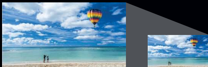
4K UHD Capturing 3840x2160

Over Sampling HD Processing enables Full HD recording by utilizing the outstanding 4K UHD CMOS Sensor, delivering brilliant image quality for virtually any news-gathering application.