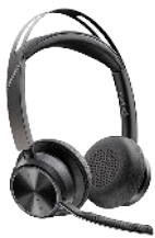
Voyager Focus 2

Poly Sync Family USB/Bluetooth® smart speakerphones provide premium sound, easy connections, and flawless meetings. Poly Sync 20 for personal spaces and Poly Sync 40 and Poly Sync 60 for small to medium conference rooms.