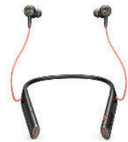
Voyager 6200 UC