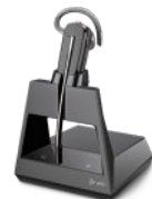
Voyager 4245 Office