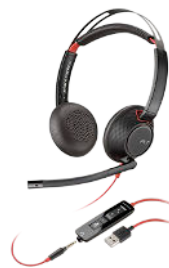
Blackwire 5200 Series