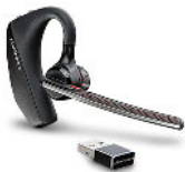
Voyager 5200 UC