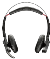
Voyager Focus UC