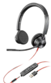
Blackwire 3300 Series