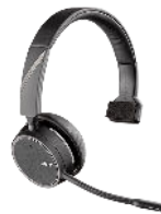
Voyager 4200 Office UC Series