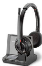
Savi 8200 Office UC Series