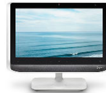
Poly Studio P21