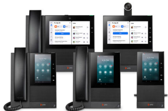
CCX Open SIP Series