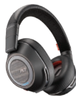
Voyager 8200 UC